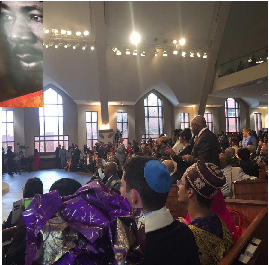
CG Stephens attended the inspiring Martin Luther King Day Commemoration at Ebenezer Baptist Church in Atlanta.