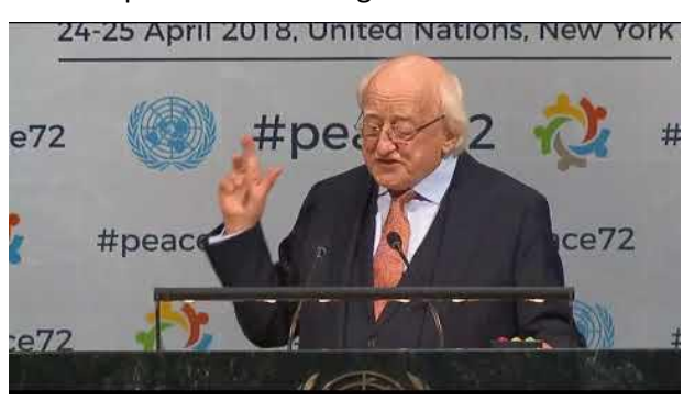
President Higgins addressing the General Assembly on 24<sup>th</sup> April 2018. President Higgins became a Champion for the HeforShe Campaign in 2015

women in conflict resolution and referenced the role of women in garnering peace on the Island of Ireland. He stated that, 'our peace could not have been achieved without the steady and courageous activism of civic organisations campaigning for a more just and peaceful society, many of which were led by the women of Ireland, North and South'. See the full speech here.