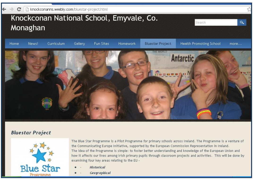
The Blue Star Programme featuring on the website of Knockconan NS, Co. Monaghan

When researching their projects, pupils were encouraged to use all means of technology available to them, including online resources. Many projects were presented using interactive tools such as Power Point, video clips, audio clips, blogging sites and school websites. The use of technology amongst the different schools was extremely impressive and brought the goals of the Programme to life in a technological sense. In addition to this online aspect, soft copies of the Programme final reports were also submitted in several cases.