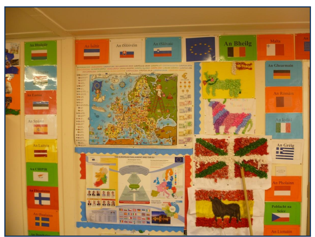
Examples of Blue Star geographical projects

This section of the Programme was one of the most successful aspects. Pupils from outside Ireland were encouraged to share their knowledge of their home countries with classmates which helped integrate non-Irish pupils amongst the school population in addition to increasing awareness and knowledge of different nationalities and cultures amongst all participating schools. The success of this aspect of the initiative was demonstrated on the school visits where non-Irish pupils provided an overview of their home country. In addition, parents were often invited to present to the different classes. This in turn helped to extend the Programme to something beyond an abstract concept in the classroom.