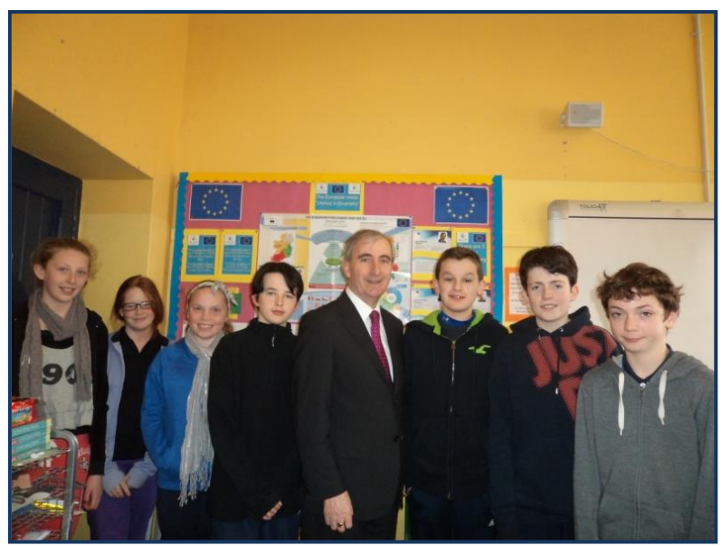
Gay Mitchell MEP visiting a Blue Star school

In the remaining weeks of the school term, many more schools from all over the country received visits from MEPs and European Ambassadors, as they raised their EU flags and celebrated successful completion of the Blue Star Programme 2012-2013.