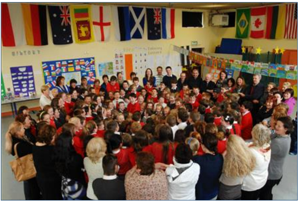
Pupils, teachers and parents at Scoil an Chroí Ró-Naofa, Castletownbere, participating in National Handshake on Europe Day