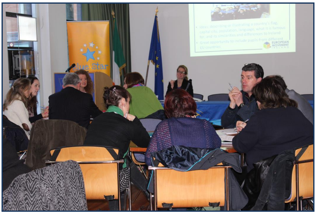
Teachers attending the Blue Star training day in February

The feedback from the training day was overwhelmingly positive with every teacher confirming that they found the training day helpful in their surveys. It was very useful for us also as National Implementation Body to hear from teachers in a non-school environment on their recommendations for the Blue Star Programme as it develops.