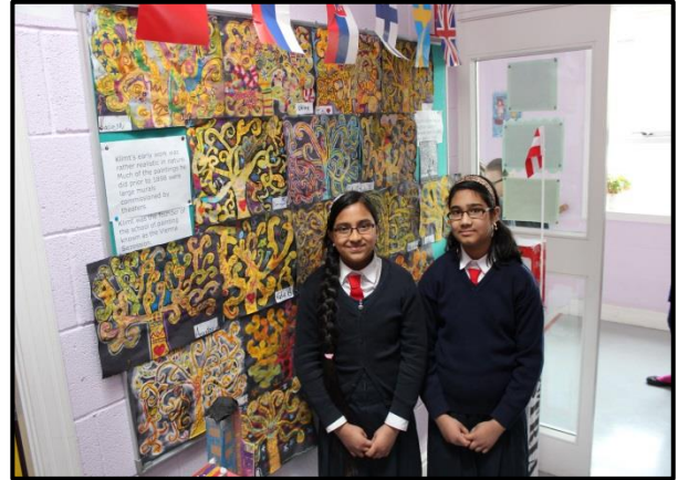
Examples of the cultural and creative work completed by students in Gaelscoil Inse Chor and Gardiner St. NS, Dublin

Again, in relation to this module, feedback from teachers and principals was very positive. It was felt that the Cultural and Creative section of the Programme was a great way to include the whole school in the Blue Star Programme and also provided an opportunity for non-Irish pupils to showcase their own cultures.