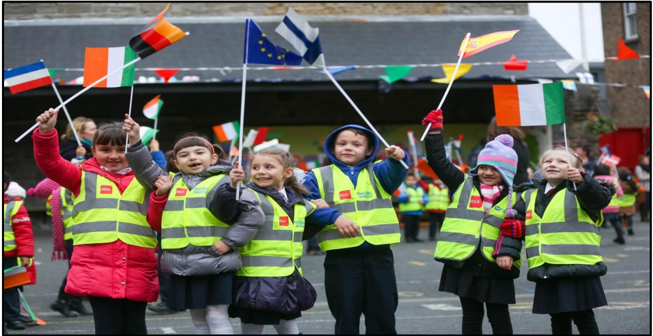
Pupils from Gardiner Street NS show off their Blue Star work to Minister Donohoe

These visits took many forms and allowed schools to show off their hard work and ask questions of the visitors.