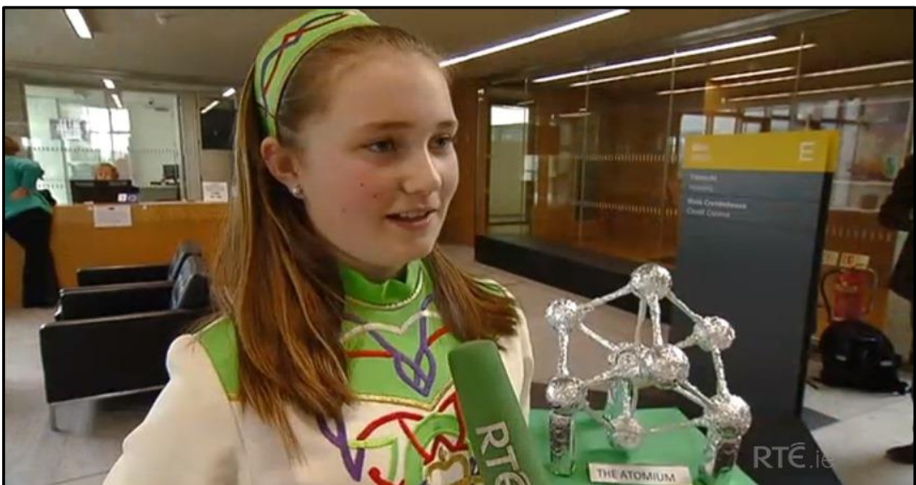
A pupil from Wexford is interviewed by RTÉ News2Day in Wexford County Hall as part of their coverage of their Europe Day Celebrations and Handshake for Europe – RTÉ News2Day, 9 May 2014

Following on from last year, given that a number of participating Blue Star schools are active online and on social media sites, such as Twitter and Facebook, we encouraged schools to use social media to highlight their participation in the Programme and promote their Europe Day activities. Schools gained recognition and engagement from many high profile individuals and organisations, such as Craggagh NS, Mayo and Gaelscoil Mhuscraí, Cork who were nominated for a prestigious Eircom Junior Spider Award for their Blue Star work online.