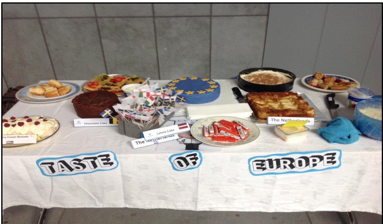
A tasty example of the Cultural & Creative Blue Star work in Wexford County Hall

Again, in relation to this module, feedback from teachers and principals was very positive. It was felt that the Cultural and Creative section of the Programme was a great way to include the whole school in the Blue Star Programme and also provided an opportunity for non-Irish pupils to showcase their own cultures.