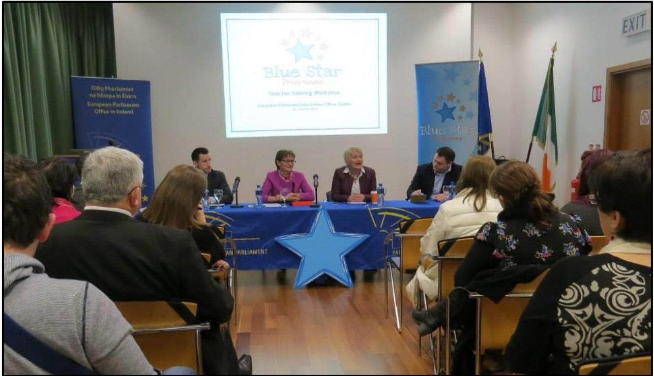
Teachers at the Blue Star training day in the European Parliament Information Office, Dublin - January 2014

The feedback from the training day was overwhelmingly positive with every teacher confirming that they found the training day helpful in their surveys. It was very useful for us also as National Implementation Body to hear from teachers in a non-school environment on their recommendations for the Blue Star Programme as it develops.