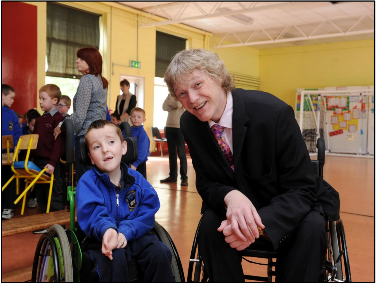
Brian Crowley MEP with a participating Blue Star pupil on a visit to Sunday's Well Boys NS, Cork