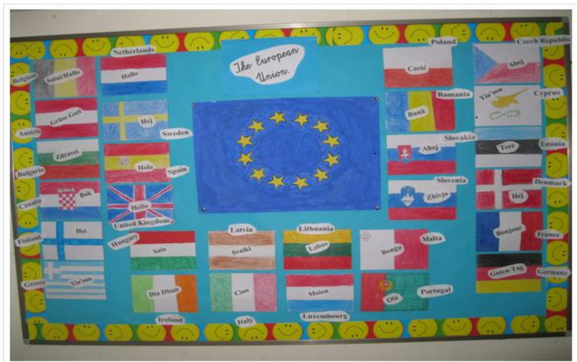
The Blue Star Programme featuring on the website of Clooneyquinn NS, Roscommon

Here is our EU noticeboard, it shows each of the 28 member states and how to say 'Hello' in each language.