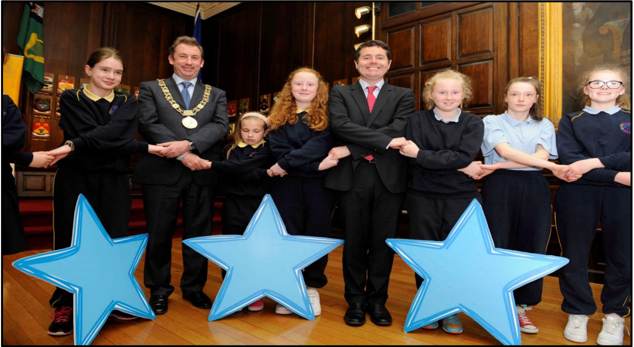
The “Handshake for Europe” initiative in action in the Mansion House

Other schools chose to conduct celebrations on Europe Day itself, but rather on a different day during Europe Week which was more suitable to their school calendar. Activities that took place included a joint-exhibition of Blue Star work and a food-fair in Wexford County Hall by two participating Blue Star schools from Wexford, a music and dance exhibition in Gardiner Street NS, European parades in Rathmore NS and a Geographical table quiz in Belmayne ETNS.