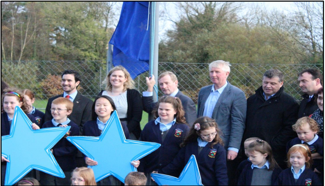
Taoiseach Enda Kenny raises the EU flag in Craggagh NS, Mayo to acknowledge their successful participation in the Blue Star Programme

In the remaining weeks of the school term, many more schools from all over the country received visits from MEPs and European Ambassadors, as they raised their EU flags and celebrated successful completion of the Blue Star Programme.