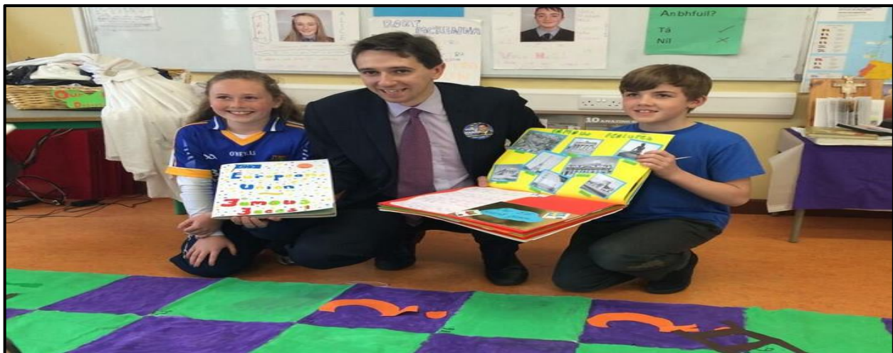
MEP candidate Simon Harris visits Aughrim NS, Wicklow