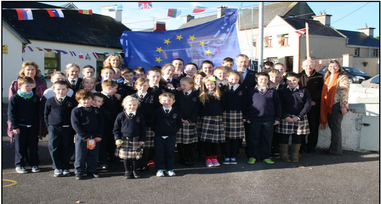
Seán Kelly MEP raises the European flag in Knocknagoshel NS, Kerry

In the remaining weeks of the school term, many more schools from all over the country received visits from MEPs and European Ambassadors, as they raised their EU flags and celebrated successful completion of the Blue Star Programme.