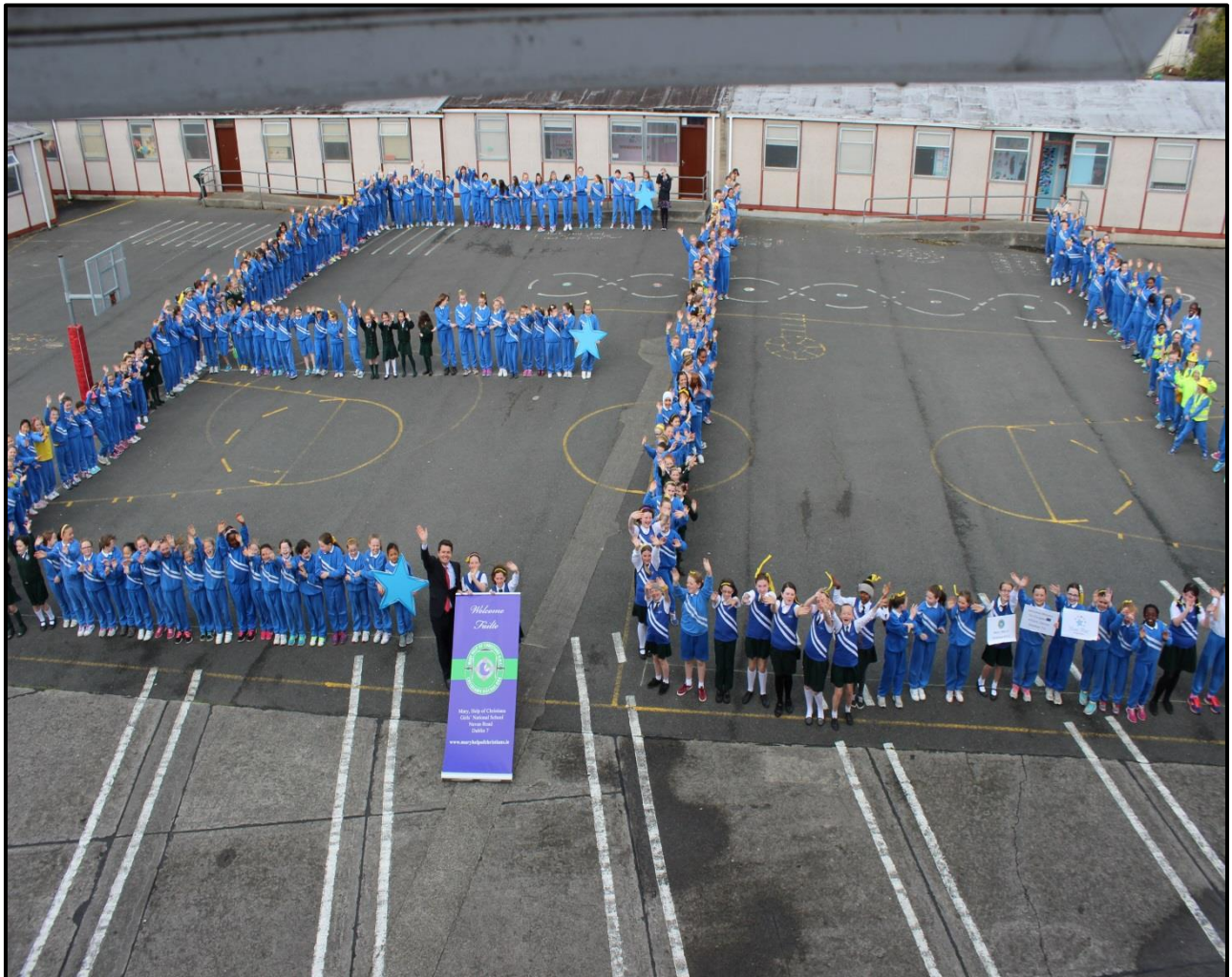
Mary Help of Christians GNS Europe Day celebrations with Minister Donohoe