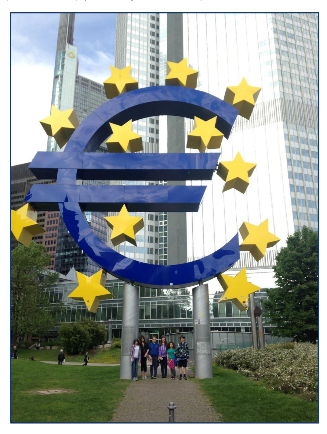
Pupils from Navan Educate Together National School, Co. Meath on their trip to Frankfurt (above)

Under the Institutional section of the Blue Star Programme, pupils learn about how the EU works, how the different Institutions cooperate with each other and the impact that these Institutions have on the daily lives of EU citizens. Many of the pupils made posters which illustrated the timeline and different Institutions of the EU. Navan Educate Together National School in Co. Meath organised a trip to Germany for a group of their 6th class pupils, including a visit to the European Central Bank in Frankfurt.