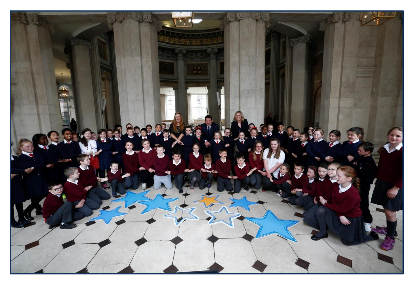
"Handshake for Europe" in Dublin City Hall marking Europe Day (above)

Over 100 schools with approximately 10,000 pupils, in communities across Ireland participated in their own Europe Day events. Representing all of them at Dublin City Hall were pupils from Gardiner Street National School, Dublin, and Saint Thomas' National School, Co. Westmeath. These Leinster schools were chosen because both had participated in the Blue Star Programme in each of the 5 years since its establishment. With Dara Murphy TD and Deputy Lord Mayor of Dublin, Councillor Janice Boylan, the pupils formed a handshake chain to celebrate Europe. The pupils then presented their Blue Star project work, and the two schools were awarded with a trophy from Deputy Murphy to mark their 5 year participation in the Blue Star Programme. This event was filmed by RTÉ News2Day and broadcast on the programme later on Europe Day.