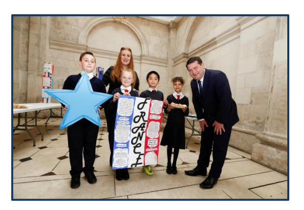
Europe Day celebrations in Dublin City Hall (above left and right)