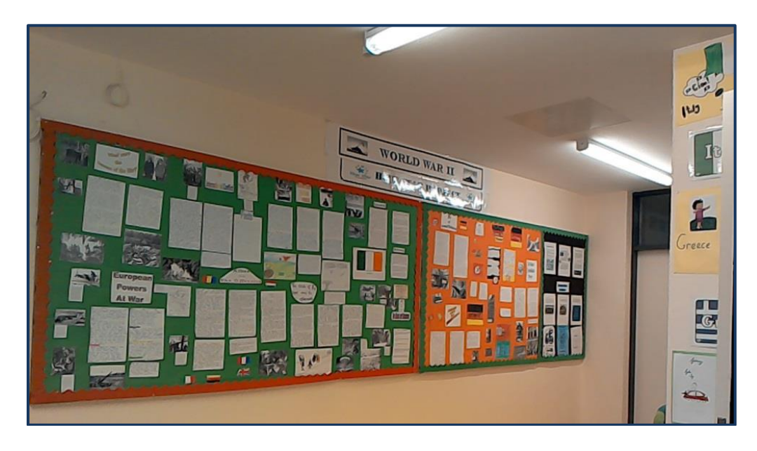
Pupils in Saint Mary's Central National School, Co. Tipperary assembled their World War II project on a large wall display in the school hall for all pupils and teachers to see (above)