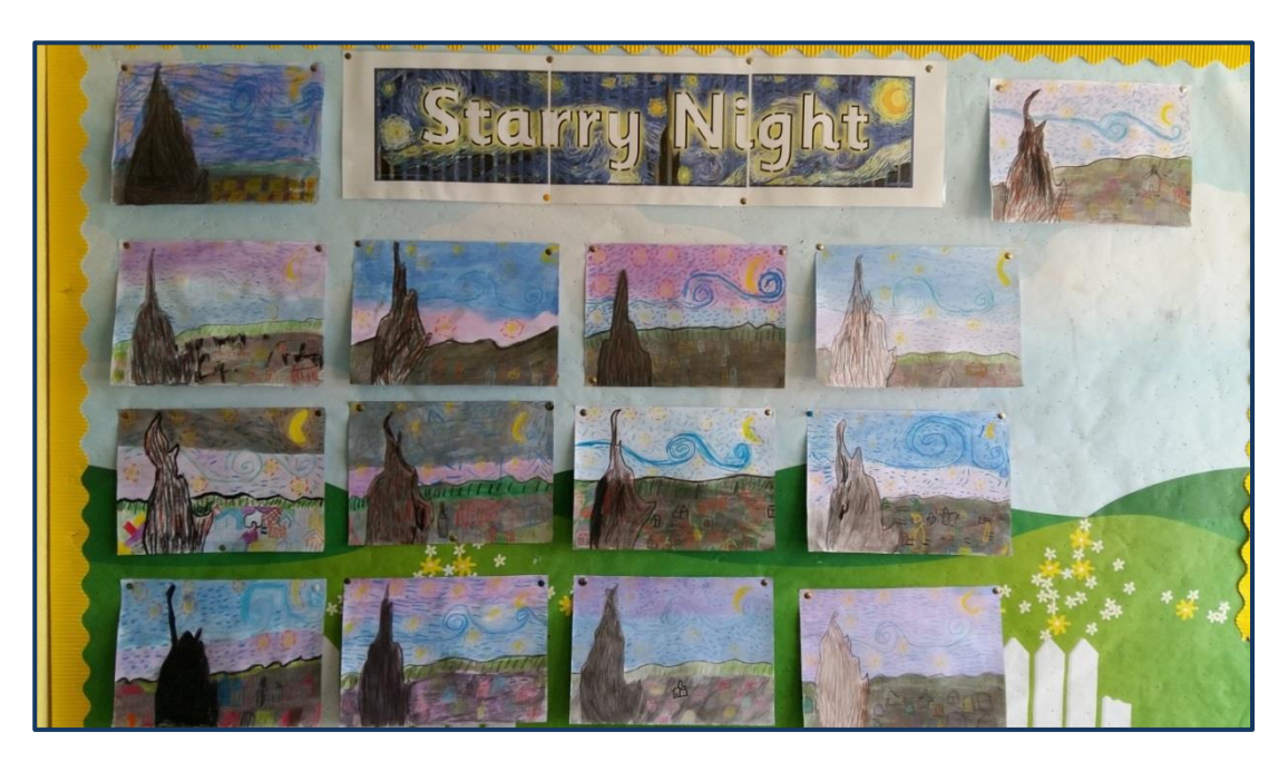
Pupils from Cappagh National School, Co. Offaly painted their own interpretations of Vincent van Gogh's "The Starry Night" (above)

This module led to some interesting and high quality submissions ranging from class reactions to "Ode to Joy", costume design work and some excellent interpretations of European art.