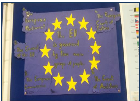
Pupils in Saint Patrick's National School, Co. Louth made a timeline of the development of the EU (above left); Pupils in Bunscoil Rinn an Chabhlaigh, Co. Cork made a poster on the different EU Institutions (above right)

Pupils also organised debates and completed projects on 'A Day in the Life of an MEP'. A number of MEPs, Oireachtas Members and European Ambassadors visited schools to speak about Europe and answer pupils' questions on their work as public representatives.