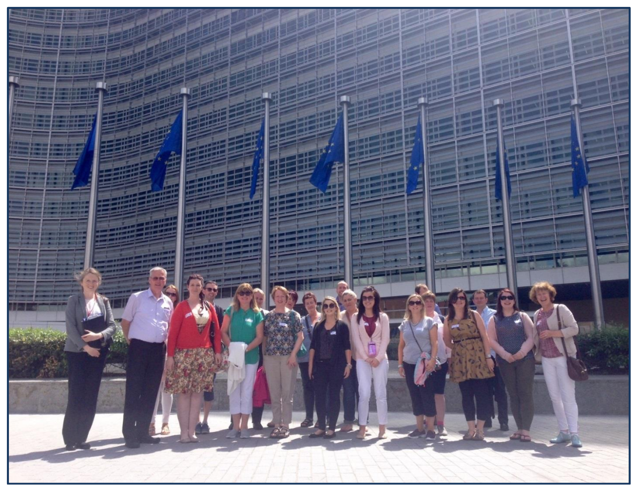
Blue Star teachers on their visit to the European Commission, Brussels in July 2016 (above)