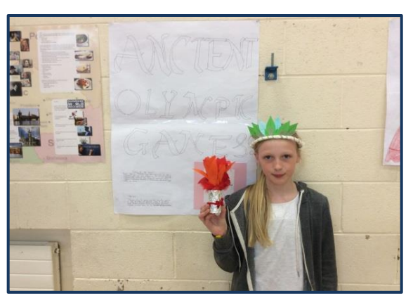
Pupils in Scoil Mhuire agus Naomh Treasa, Co. Kerry used art work to depict different historical events such as the Storming of the Bastille in Paris in 1789 (above left); Pupils in Castleknock Educate Together National School, Dublin did projects on the Ancient Olympic Games (above right)