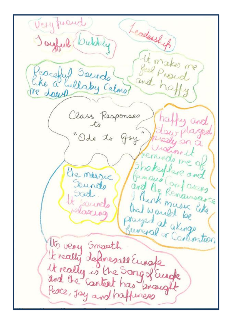
Bohermore National School, Co. Limerick listened to "Ode to Joy" and recorded their reactions to it (above)

Feedback from teachers and principals was very positive in relation to this module. It was felt that the Cultural and Creative section of the programme was a great way to include the whole school in the Blue Star Programme and also provided an opportunity for non-Irish pupils to showcase their own cultures. This part of the Programme also further engaged the wider community as parents were invited to assist their children in putting together their projects and contributing in any other way they felt would be interesting and beneficial for the Blue Star participants.