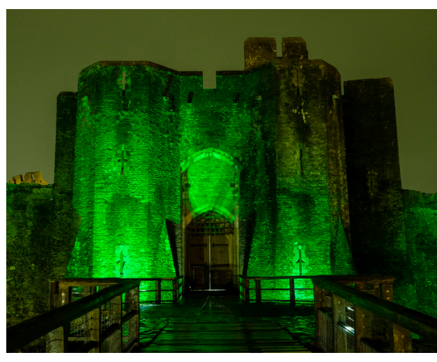
Greening of Caerphilly Castle, South Wales, St Patrick's Day 2020.