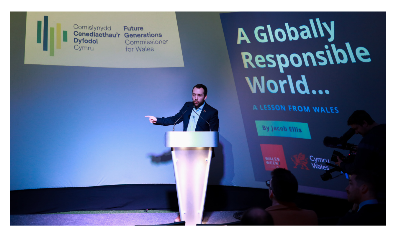
Policy discussion on the Welsh Wellbeing of Future Generations Act at Wales Week 2020, Dublin.