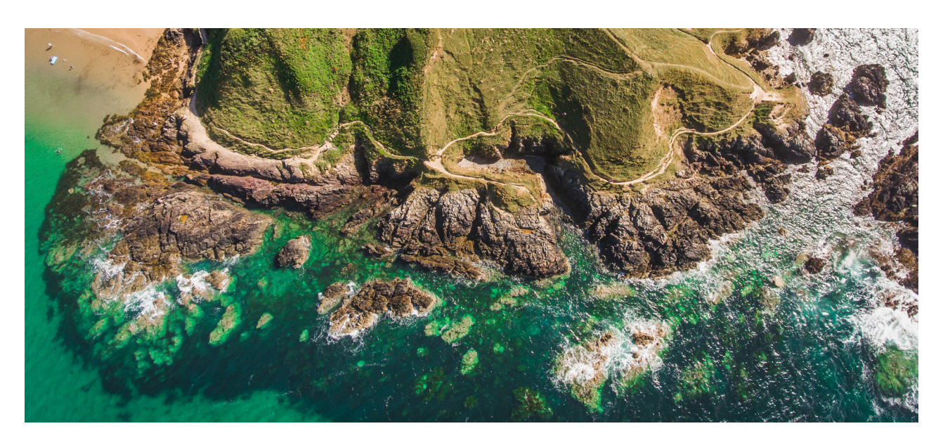
Porthor, Gwynedd, a prominent site of tourism and conservation work, is one of the closest points to Ireland on the Welsh coast.