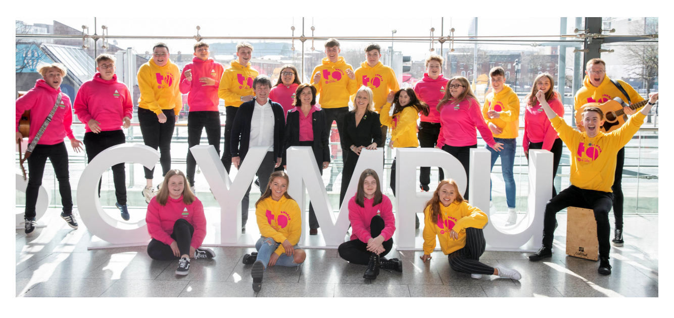
Urdd Gobaith Cymru and TG Lurgan members together at the launch of their bilingual partnership in Dublin.