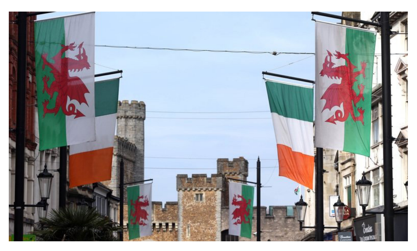
Irish and Welsh flags line the streets of Cardiff on Match Day.

During the lifetime of our Shared Statement 2021-2025, we will facilitate and support collaborations which will deliver lasting, positive and mutually beneficial outcomes. Central to this will be an annual Ireland-Wales Forum, convened by the Consulate General of Ireland in Cardiff and the Welsh Government Office in Dublin. The event will engage political, economic and broader stakeholders and will be an opportunity to develop relationships and deliver on the potential of current and future opportunities.