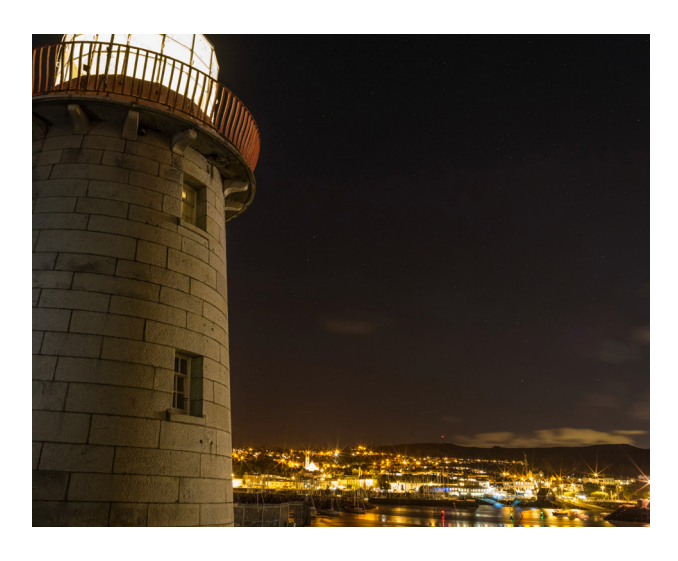
The Baily Lighthouse on Howth Head is across the Irish Sea from the Isle of Anglesey in Wales.

Tourism is a key strategic sector that has important benefits for regional development in both economies, as well as providing significant employment. As the tourism industry seeks to recover from the impact of COVID-19, Wales and Ireland will work together to share lessons in responding to this challenge.