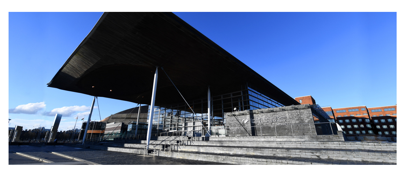
Senedd Cymru, Cardiff Bay.

To bring together voices from across all sectors, we will launch an annual Ireland-Wales Forum in 2021 as an important new space for dialogue and building relationships. The Forum will be convened by Ireland's Consulate General in Cardiff and the Welsh Government Office in Dublin. Themes for the Forum will be agreed annually and a key theme of the first Forum, in late 2021, will be sustainability and green recovery, ahead of the 2021 United Nations Climate Change Conference (COP26) being hosted by the UK.