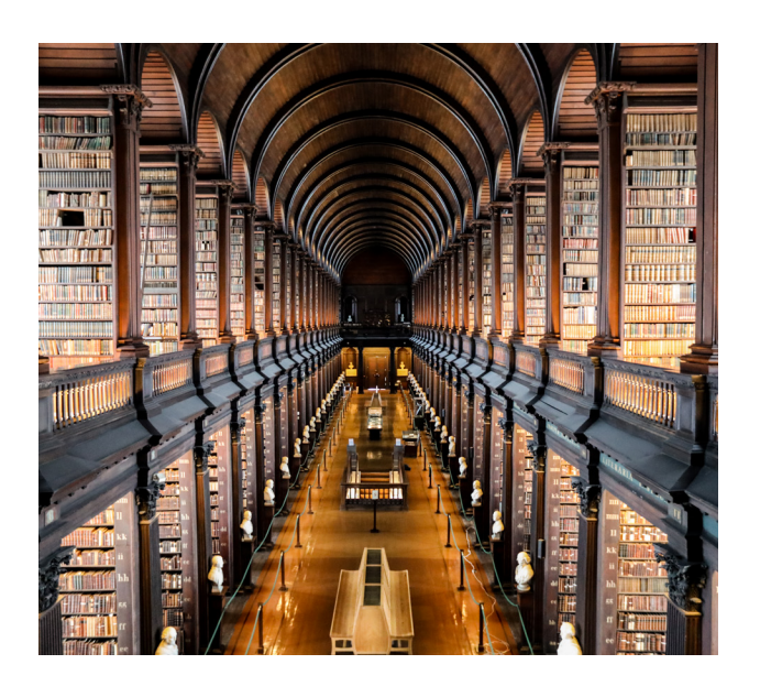
The Long Room in the Old Library, Trinity College Dublin.

Many of the existing strong and fruitful connections between academic institutions are grounded in EU programmes such as the Framework Research Programmes (Horizon 2020), Erasmus+, the Ireland Wales Programme, and UK-Ireland research cooperation programmes. As we adapt to the new context with the UK outside the EU, we are committed to supporting institutions to explore all avenues to maintain these strong collaborations.