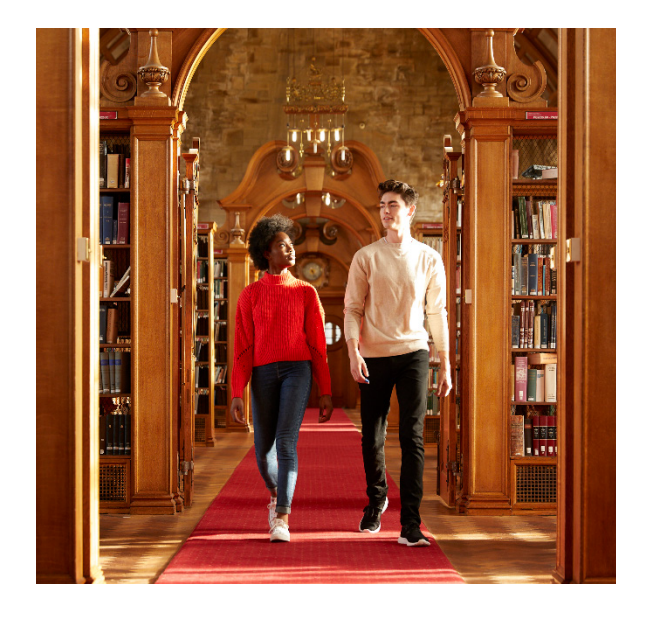
Bangor University, Wales

From monastic times, scholars have moved routinely between Wales and Ireland, a tradition reflected in more recent exchanges of students, pupils, researchers, trainees and academics between Irish and Welsh academic institutions.