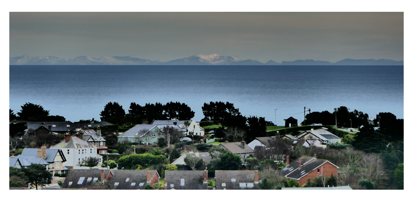
Snowdon in Wales seen from Howth peninsula, Dublin.