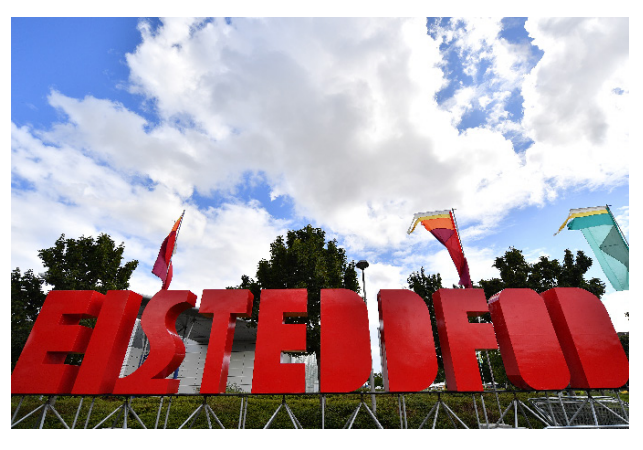
The National Eisteddfod 2018, Cardiff.