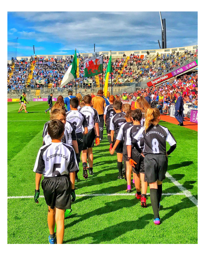
St Joseph's Swansea GAA team at Croke Park.

That the first Welsh-language radio broadcast was made from Dublin is evidence of more modern links, as are the many Irish social, sports and music clubs which have flourished across all of Wales.