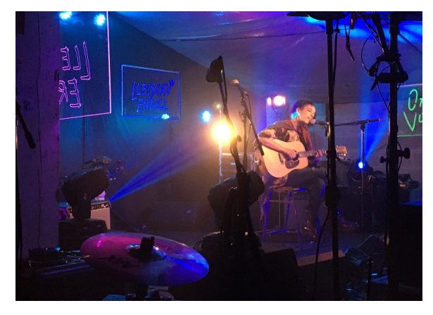
Other Voices at St Mary's Church, Ceredigion.

We value the importance of language and cultural diversity in these islands, and know that we can learn from one another in the areas of language policy development and bilingualism.