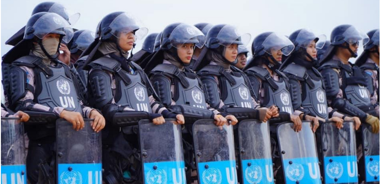
Indonesian women peacekeepers in CAR (MINUSCA)

The UN has been attempting to increase the number of women involved in UN peacekeeping for some time, and has in place the UN Gender Parity Strategy. It is widely acknowledged however by a range of policymakers through efforts such as the Elsie Initiative for Women in Peace Operations and its Measuring Opportunities for Women in Peace Operations methodology and by practitioners and academics that the pace of change is far too slow.