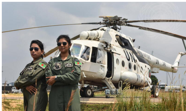
In 2017, Bangladesh sent two female combat pilots to the UN Mission in the Democratic Republic of Congo

“ Barriers are not uniform across all missions. To be effective, we must identify mission-specific barriers to guide our collective approach.”