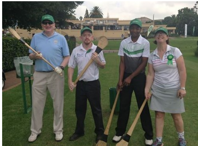
They might have had more success using these...

The Embassy entered a team (the “Zig and Zags”) in the ISAA Johannesburg St Patrick’s Day golf outing at the Wanderers. Unfortunately, they lived down to their name as their game was little better than the weather, as they finished last and took home their buckets and spades.