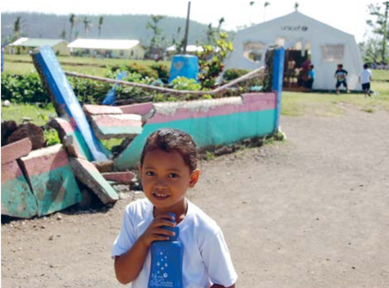
Balangiga Elementary school, Eastern Samar, Philippines.

The HPP allows NGO partners to submit their proposed annual humanitarian programmes to Irish Aid for support at the beginning of each calendar year – it may incorporate elements of preparedness, disaster risk reduction and early recovery. This funding predictability assists the NGO partners to plan for their humanitarian responses in protracted humanitarian emergencies. Seven of the eight partner agencies also receive multi-annual funds from Ireland’s Civil Society and Development Education Section (CSDEU). The HPP is designed to address humanitarian needs in situations of protracted and predictable crises and is intended to be complementary to and coherent with Ireland’s longer-term development funding. Funding is based on a robust appraisal process and a resource-based allocation model to incentivise good practice and reward performance.