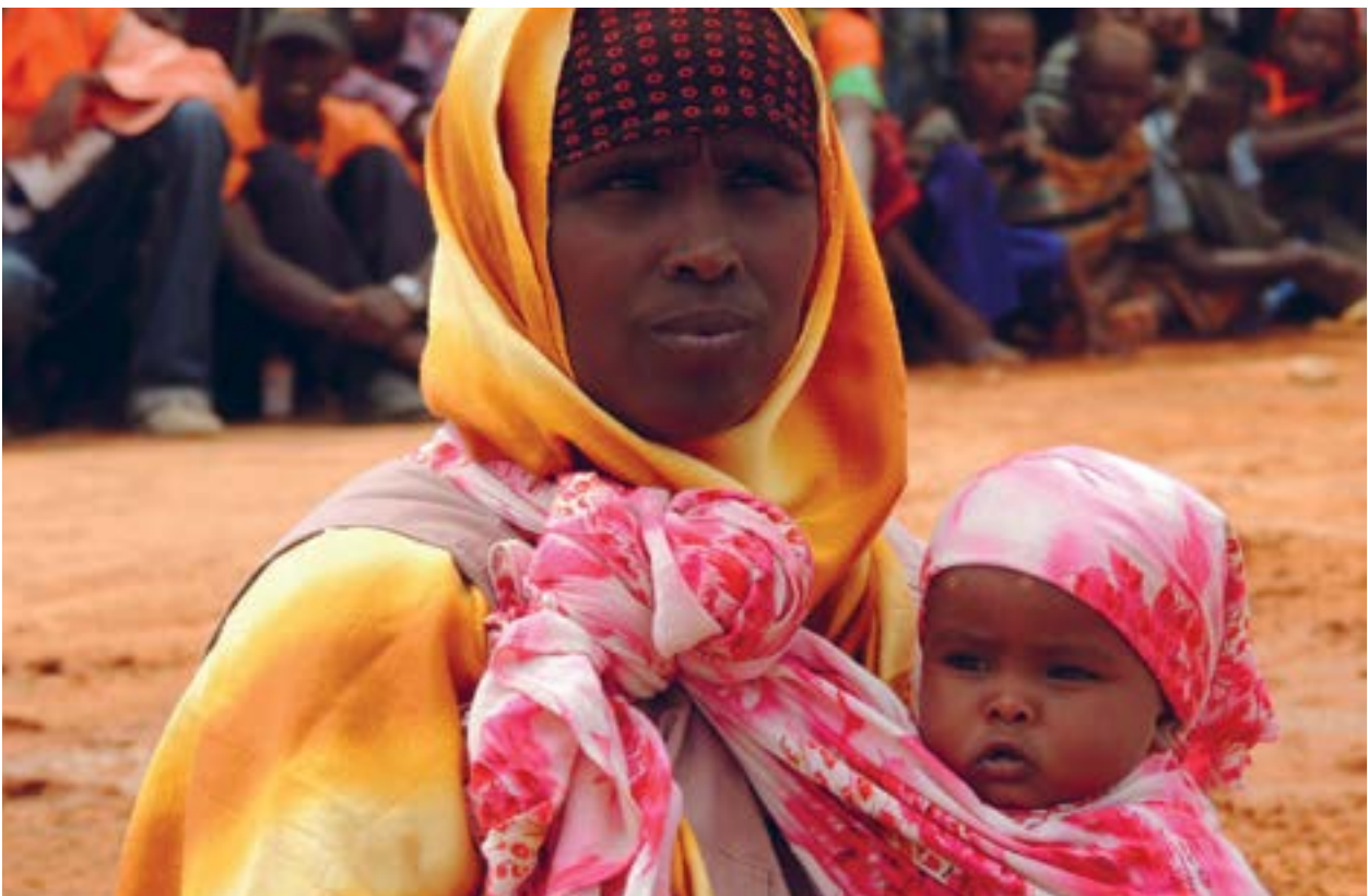
Kobe Camp in Dollo Ado, Ethiopia.

The Framework for Action (2014 - 2017), developed to deliver on Ireland's commitments in One World, One Future , Ireland's policy for international development, serves as a management instrument for the delivery of Ireland's aid programme over the coming years and to set out the higher level results that Irish Aid aims for. The Framework for Action provides a credible basis for measuring performance and demonstrating accountability across all seven of Irish Aid's priority areas for action, including Humanitarian Assistance. Any review of Ireland's Humanitarian Assistance Policy will be considered in the context of the Framework for Action.