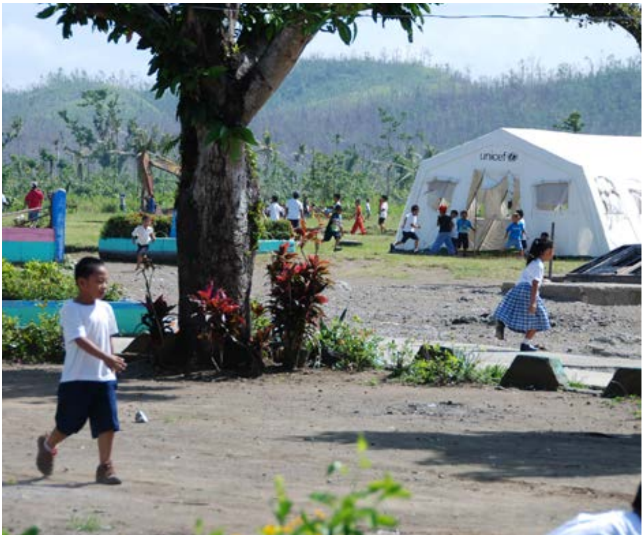
Balangiga elementary school, Eastern Samar, Philippines.