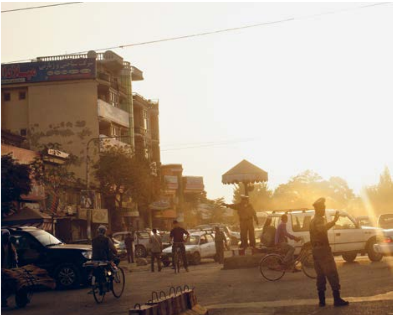
Afghanistan police directing traffic in Kabul.

The Review commits the Irish Government to continuing to promote respect for and adherence to International Humanitarian Law. Ireland also commits to addressing neglected emergencies in parts of Africa which do not always receive public attention. The Review affirms the role Ireland is playing in helping to address humanitarian crises, in the context of natural disasters, conflict situations and chronic emergencies.