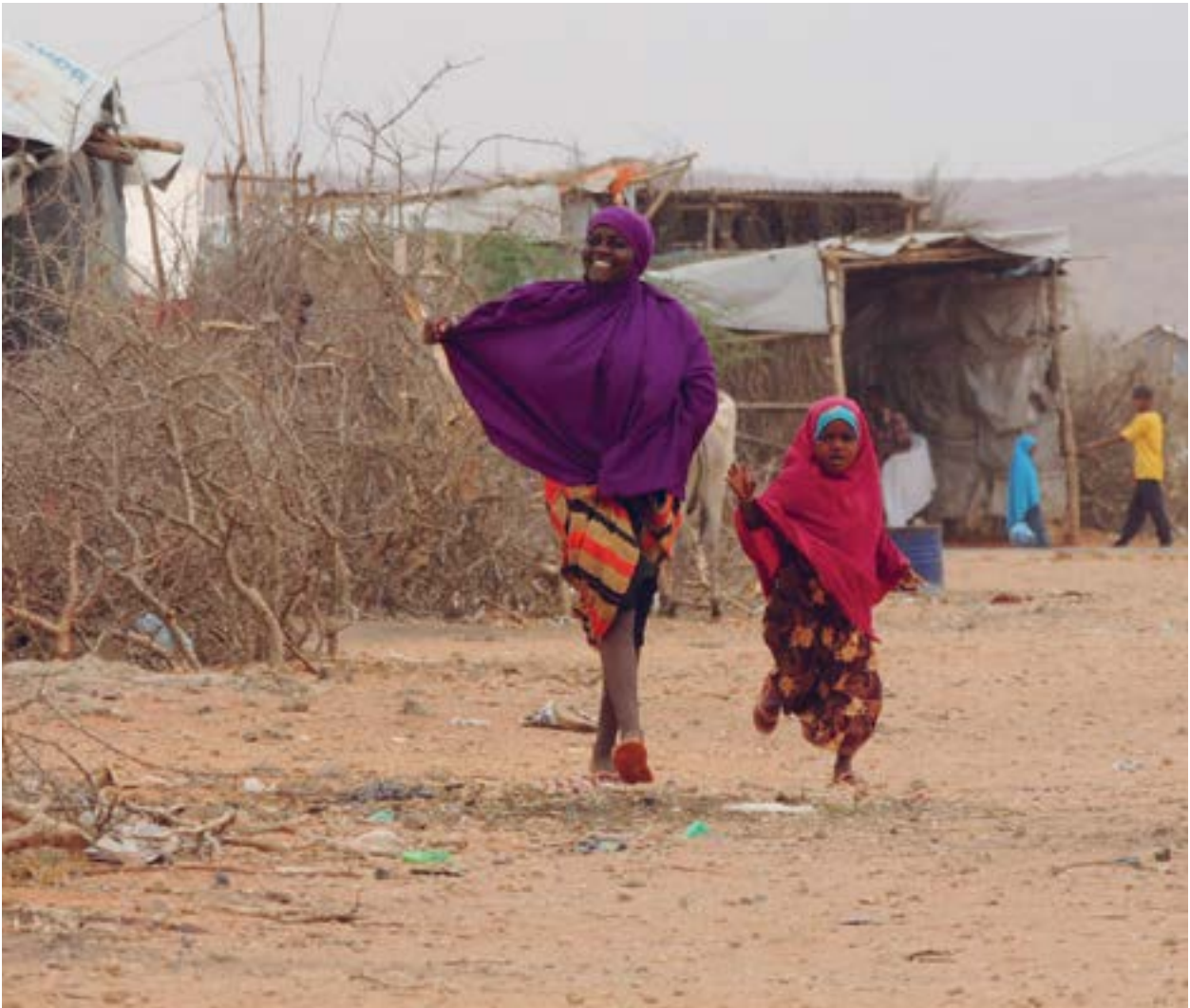
Dollo Ado Refugee Camp, Ethiopia.

The 'Transformative Agenda' is also meant to improve coordinated responses that are informed by, meet the needs of, and are accountable to, affected populations.