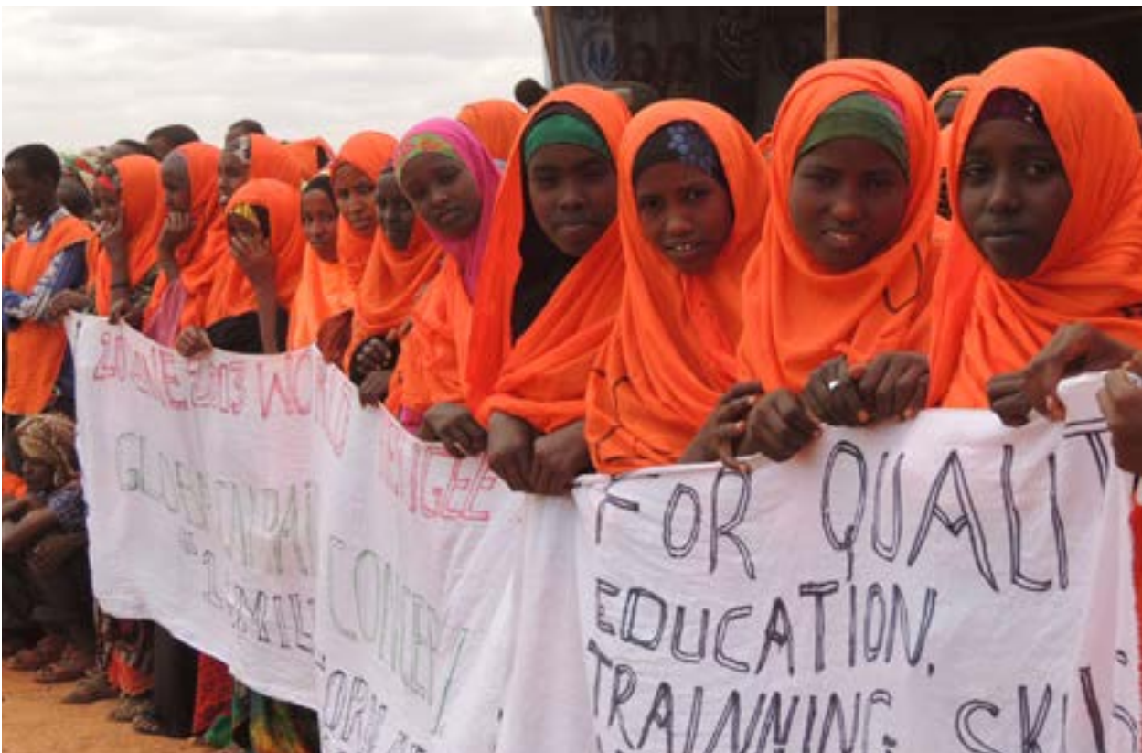
World Refugee Day at Kobe Camp, Dollo Ado, Ethiopia.