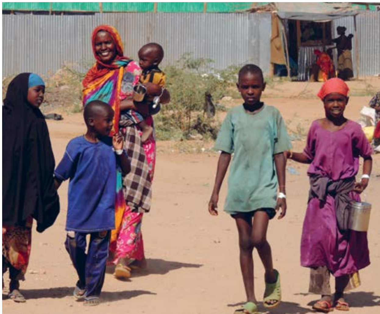
Dollo Ado Refugee Camp, Reception Centre 4, Ethiopia.