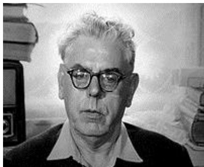
Máirtín Ó Cadhain

The Embassy will this year again participate in the Literature Night, an event organised by the Czech Centres in cooperation with EUNIC and Book World Festival in Prague. It aims at presenting contemporary European literature in new translation into Czech to the broad public. The event, which will include a reading of Irish classic Cré na Cille (Hřbitovní hlína) by Máirtín Ó Cadhain, will take place on 9 May, on the eve of Book World Festival in the Prague 1 Staré Město district.